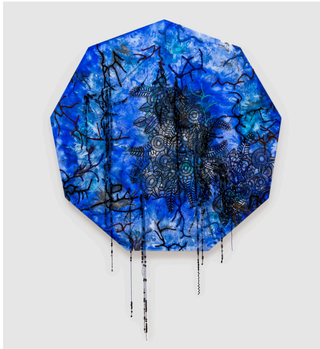
Olivia Guterson, Even The Sky is Crying , 2023, oil, acrylic, glass seed beads, glitter, and breath on canvas, 49 in diameter nonagon

—A Female-Led Performance and Group Exhibition, On View February 16—